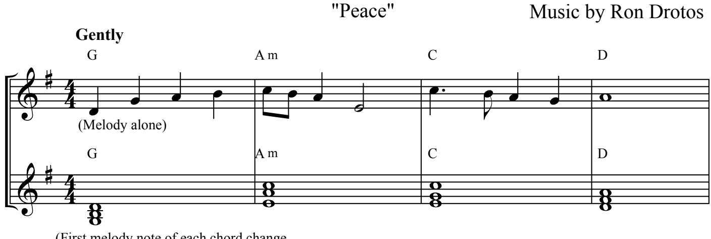
(First melody note of each chord change, with the full chord below)

This is a very important technique. Playing both chords and melody with your right hand may be a little tricky at first because you have to think of chords in a new way: visualizing them from the "top down" instead of building them up from the root. But don't worry: once you do this on a few songs it'll start to come easier for you. In the next lesson, we'll learn how to play the harmonies along with the full melody with your right hand.